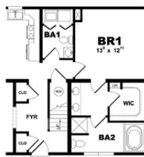
Optional Master Suite Layout