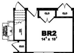
Basement Stair Option